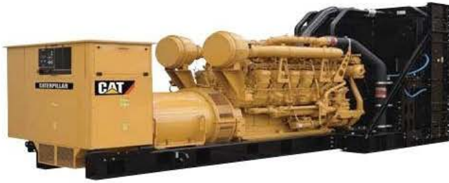
Image shown may not reflect actual package.