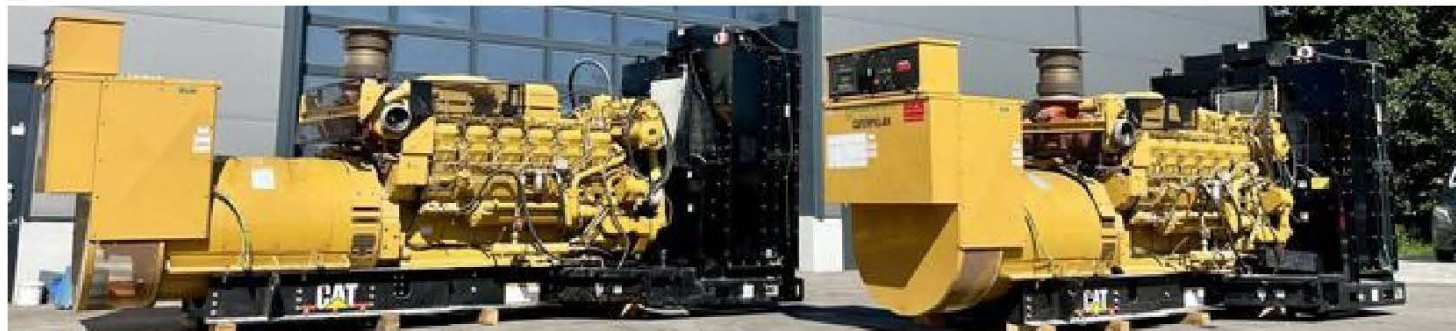
Caterpillar 1750HD, Engine 3512HD Diesel, Generator SRA 400V 50Hz 1750KVA, 209h run hours only, EMCPII controler, incl. super silence muffler, condition like new,