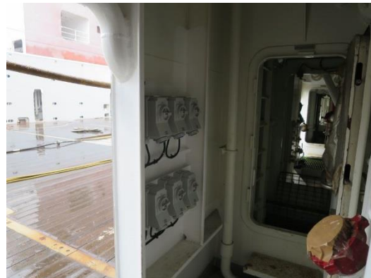
Reefer Connection PS