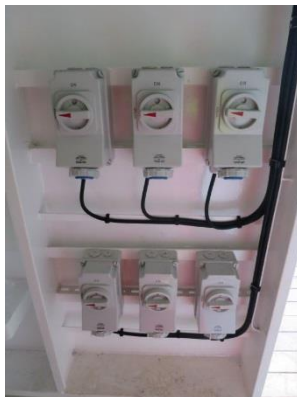
Reefer Connection SB