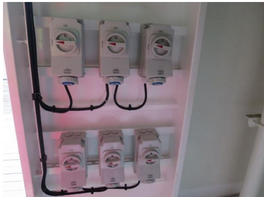
Reefer Connection PS

6 pcs 200V-260V 16A 2-phase+ground type QX7012 midship starboard side frame #39