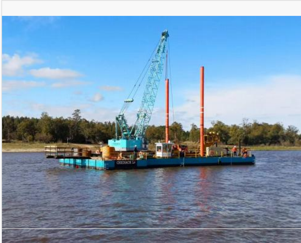
250 Tons Crane Platform

Barges and pontoons are used to support excavator, crane for bridge building and mining works