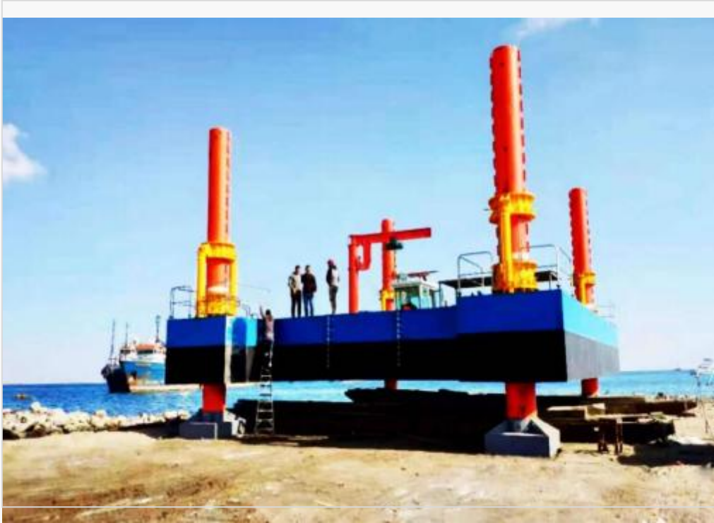
400 Tons Jack up Barge

Self-Propelled Barges is used to transport cargos, heavy equipment; Pipeline Laying works