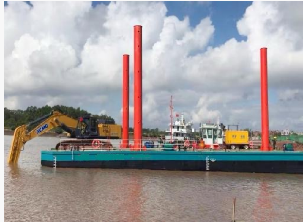
36 tons Excavator Platform