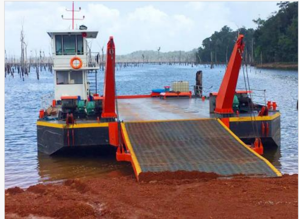
250 Tons Transportation Barge