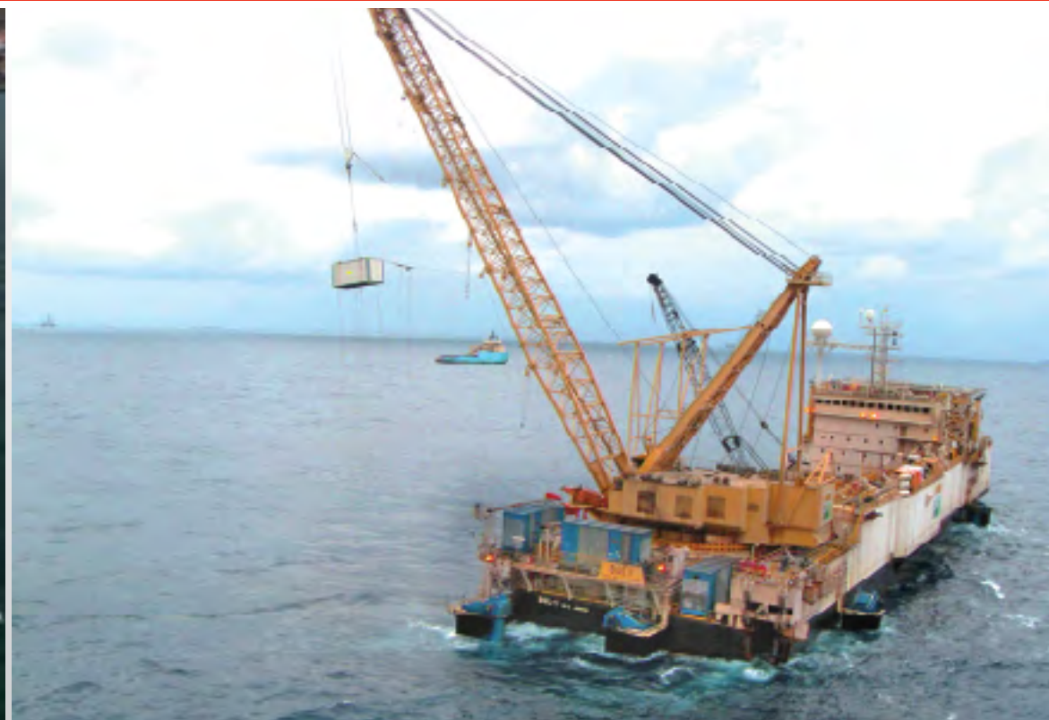
PDPS installed on the BGL-1 - a 400 ft (122 m) pipelay and derrick barge owned and operated by Petrobras. It was upgraded in 2006 with a PDPS comprising six 2000 HP (1500 kW) thrusters.