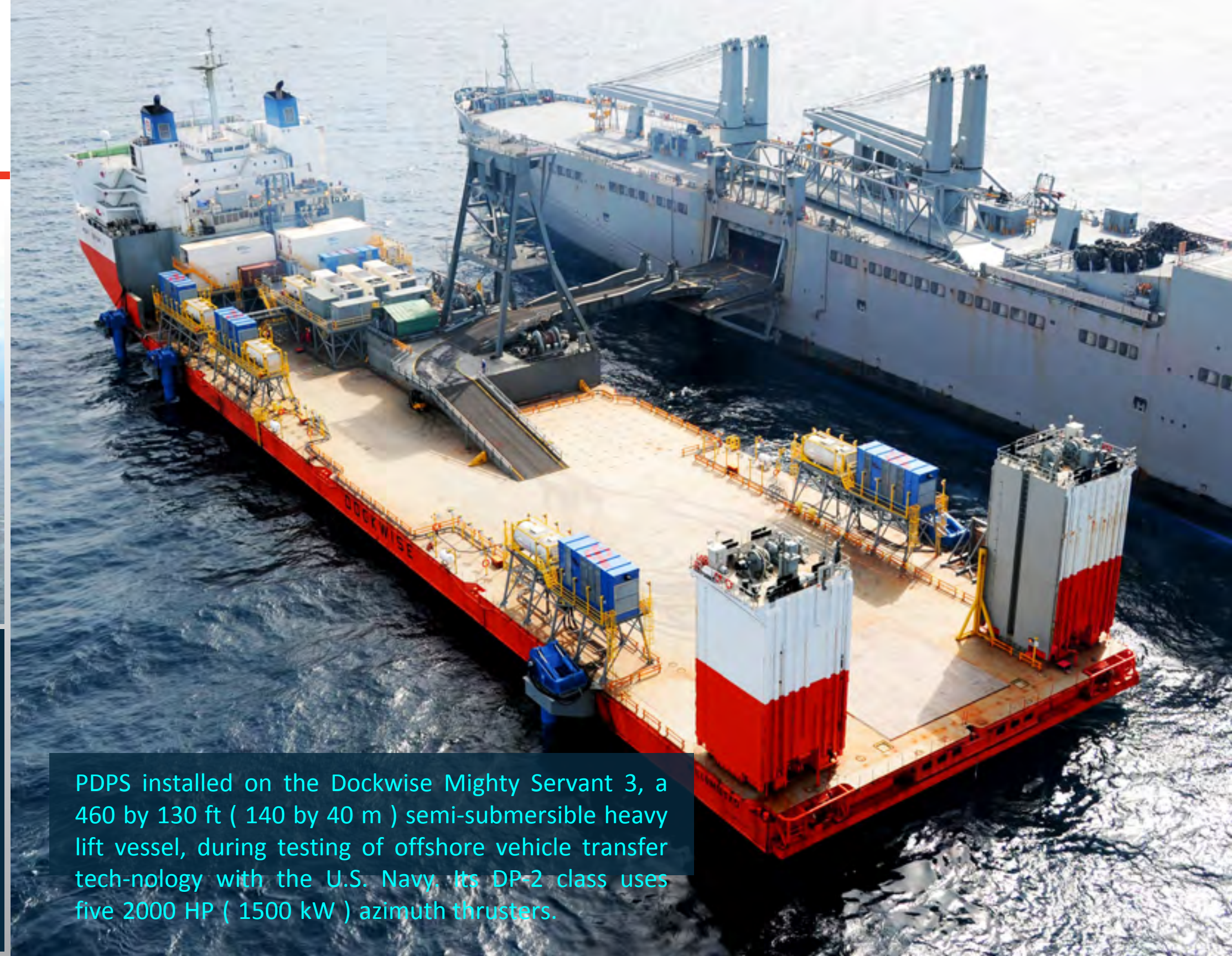
PDPS installed on the Dockwise Mighty Servant 3, a 460 by 130 ft ( 140 by 40 m ) semi-submersible heavy lift vessel, during testing of offshore vehicle transfer technology with the U.S. Navy. Its DP-2 class uses five 2000 HP ( 1500 kW ) azimuth thrusters.