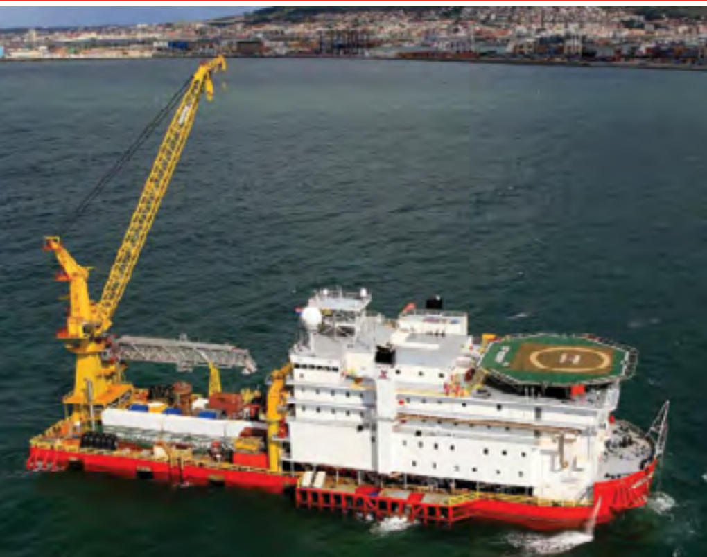
PDPS installed on the Crossmar 21 - a 260 ft (80 m) offshore construction barge. Its DPS-3 system uses four 1000 HP (750 kW) thrusters.