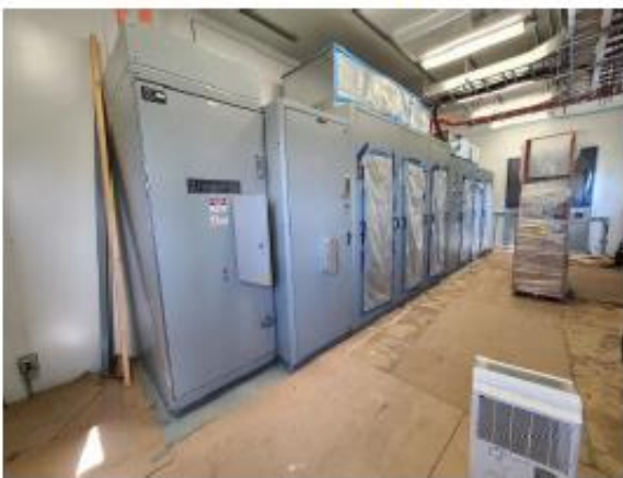
6500 HP 6900 Volt Siemens VFD