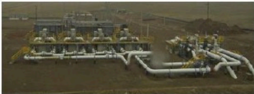
TYPICAL PUMP STATION ELEVATED