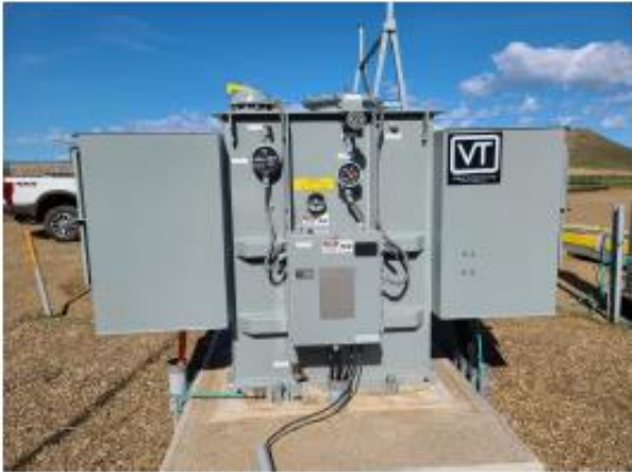
600 kVA TRANSFORMER